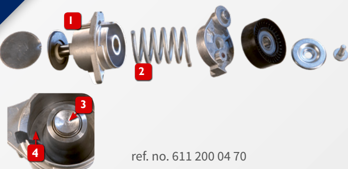
ref. no. 611 200 04 70

For more technical information please visit: partsfinder.bilsteingroup.com