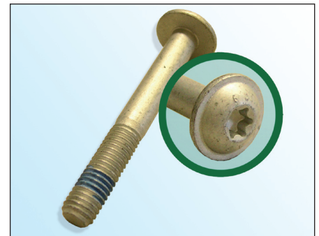
Fig. 3: LuK AS bolt

LuK AS recommends replacing the original bolt ( Fig. 2 ) with the supplied bolt.