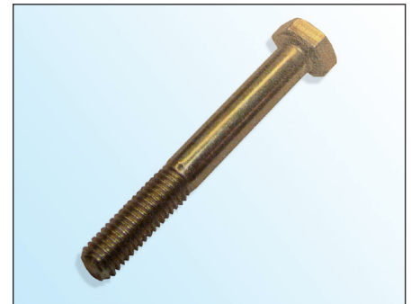
Fig. 2: OE bolt

As part of the continuous development of our products and quality assurance, LuK AS now supplies a new bolt ( fig. 3 ) with the tensioning pulley 531 0278 30 .