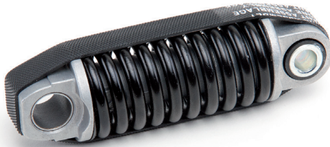
Photo 2: 533 0090 10 – Vibration damper

Belt tensioner 533 0090 10 (fig. 2) and the accompanying roller of the tensioning arm are subject to the same wear. Therefore from a technical point of view, it makes sense to replace both components at the same time. For that reason, Schaeffler Automotive Aftermarket offers belt tensioner 534 0314 10 (fig. 1) only as a complete assembly.