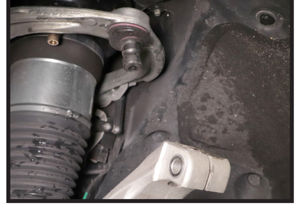
FIGURE 6 FIGURE 7