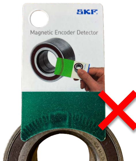
ABS magnetic impulse ring in bad condition. The magnetic sensor ring is damaged, some segments are no longer separated from each other and thus can no longer indicate an even speed signal.

As this magnetic field card is not only to be used to ensure the mounting direction, but also to ensure that the magnetic pulse ring provides the correct signal, we have adapted the shape of the card to cover a larger area of the ring on pre-assembled bearings.