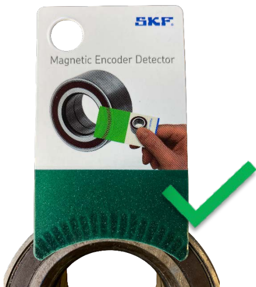
ABS magnetic impulse ring in good condition. All segments are evenly spaced, and no irregularities are visible on the entire ring.