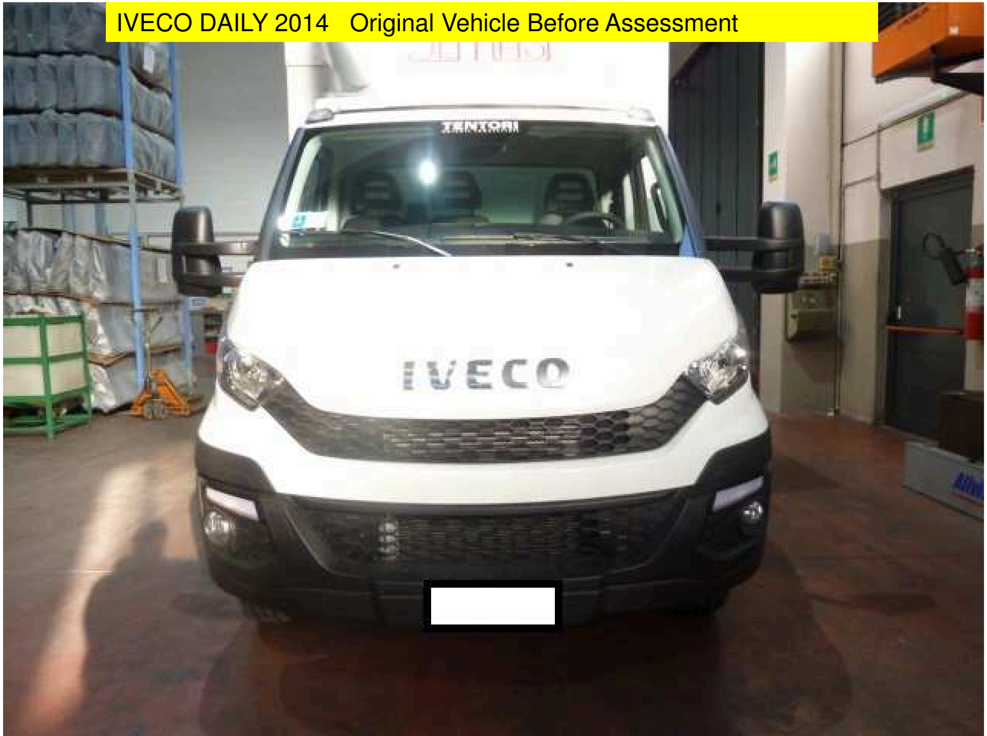
IVECO DAILY 2014 Original Vehicle Before Assessment