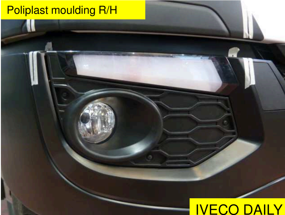
Poliplast moulding R/H