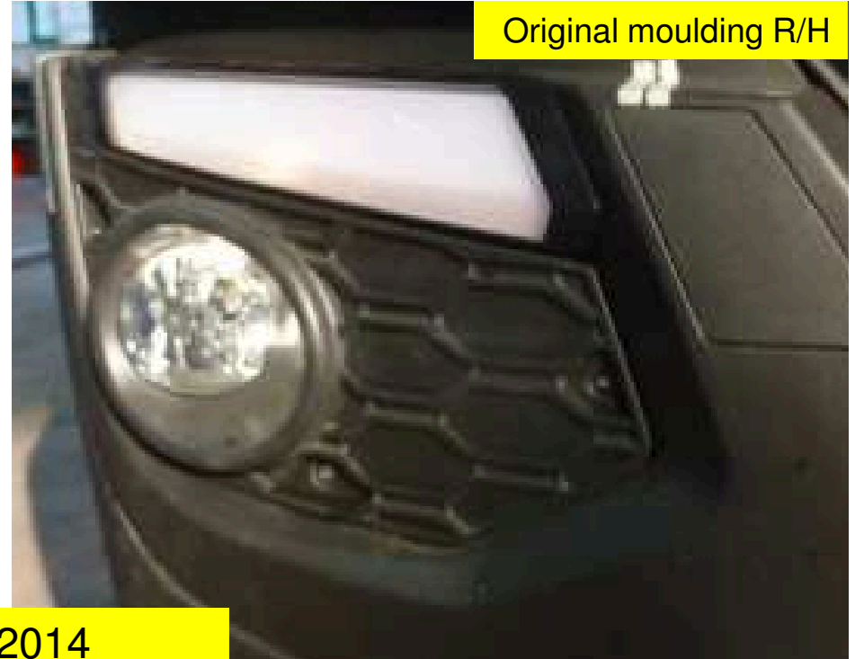
Original moulding R/H