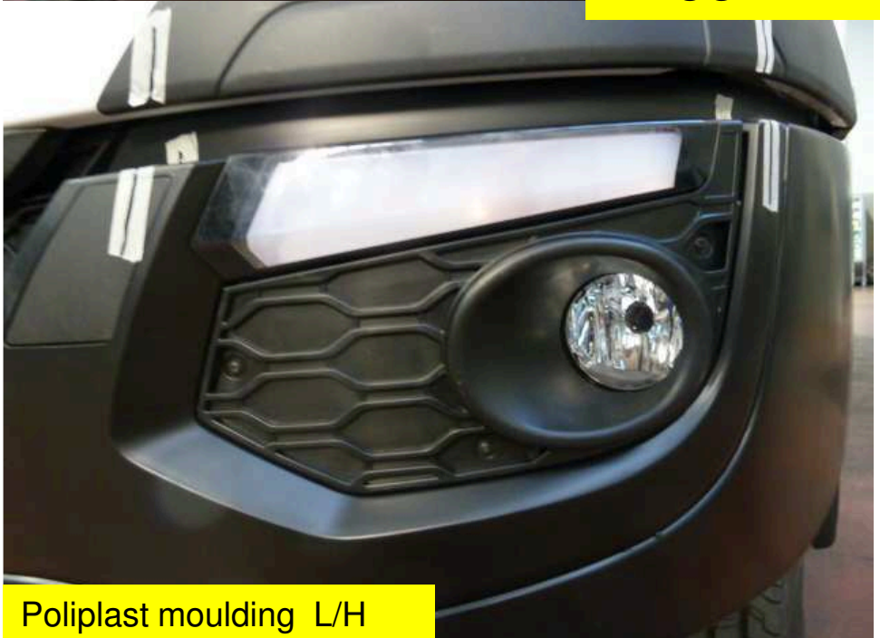
Poliplast moulding L/H