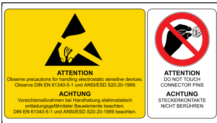
4 - ESD Hinweise / ESD Notes