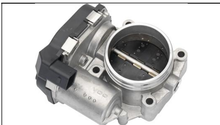
1 - Produkt / Product